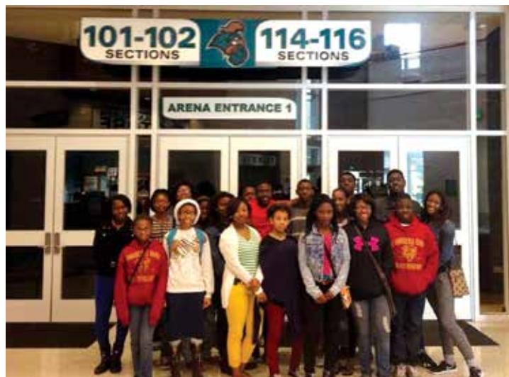
Pee Dee Community Project takes teens to Coastal Carolina University.