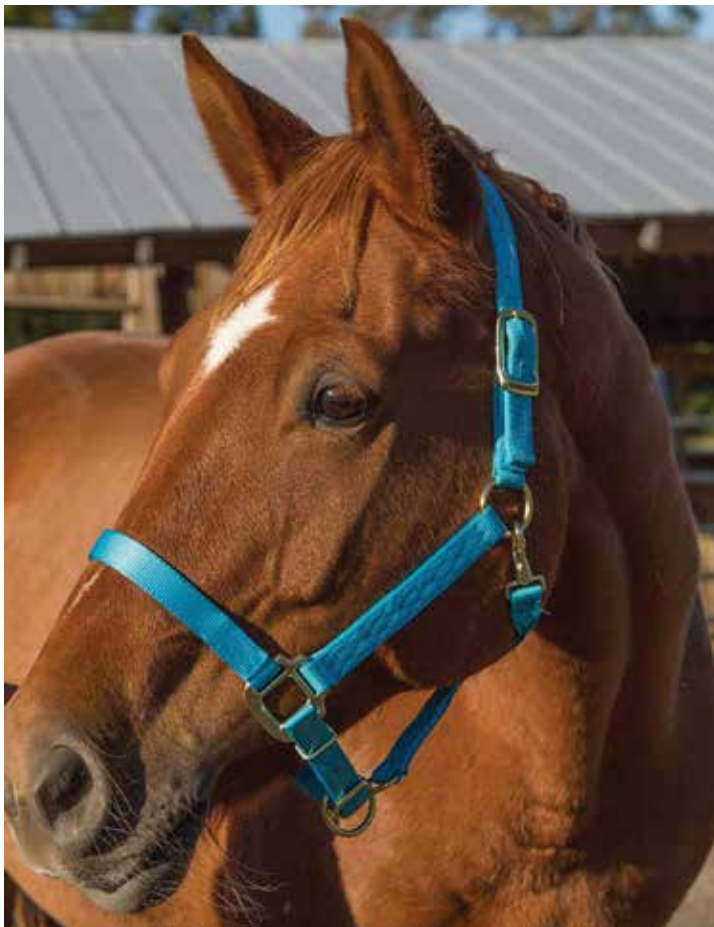
Waccamaw Community Trust's 2016 grant to Barnabas Horse Foundation sponsored therapy horse Compliments for the entire year.

Organizations like Pee Dee Community Project and Family Justice Center of Georgetown County have also seen the benefits that operating funding from the Trust can have on their missions. At Pee Dee Community Project, support since 2012 has helped take youth to college visit days, launch a math tutoring initiative and support operations at the organization.