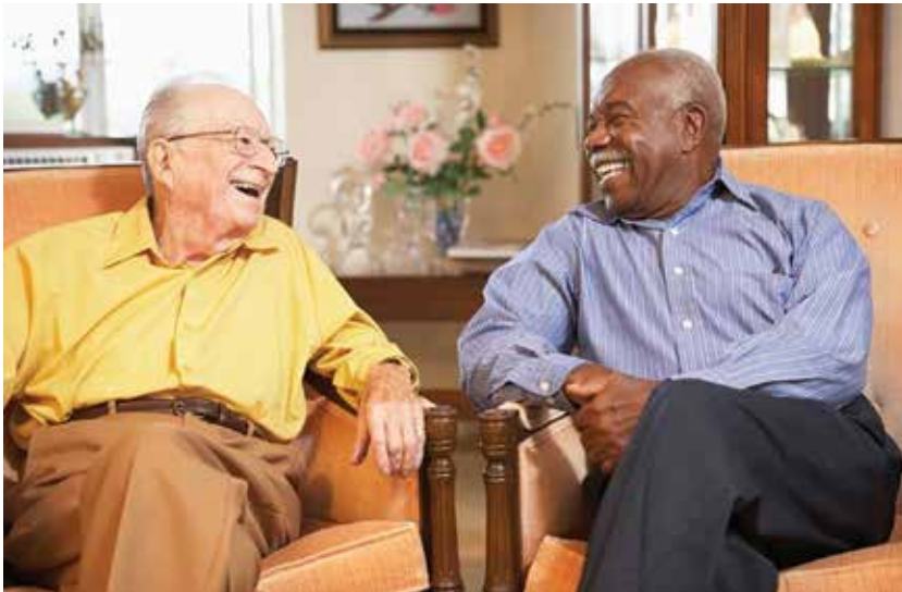
Neighbor to Neighbor received the South Carolina Association of Nonprofit Organizations’ Award for Nonprofit Excellence in 2016”