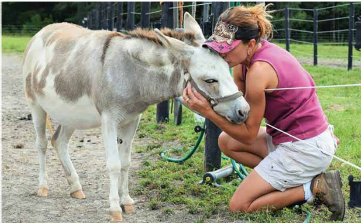
Barnabas Horse Foundation

As a permanent endowment of the Foundation, gifts to the Waccamaw Community Trust last forever, but more importantly, they will always be responsive to the needs of the community.