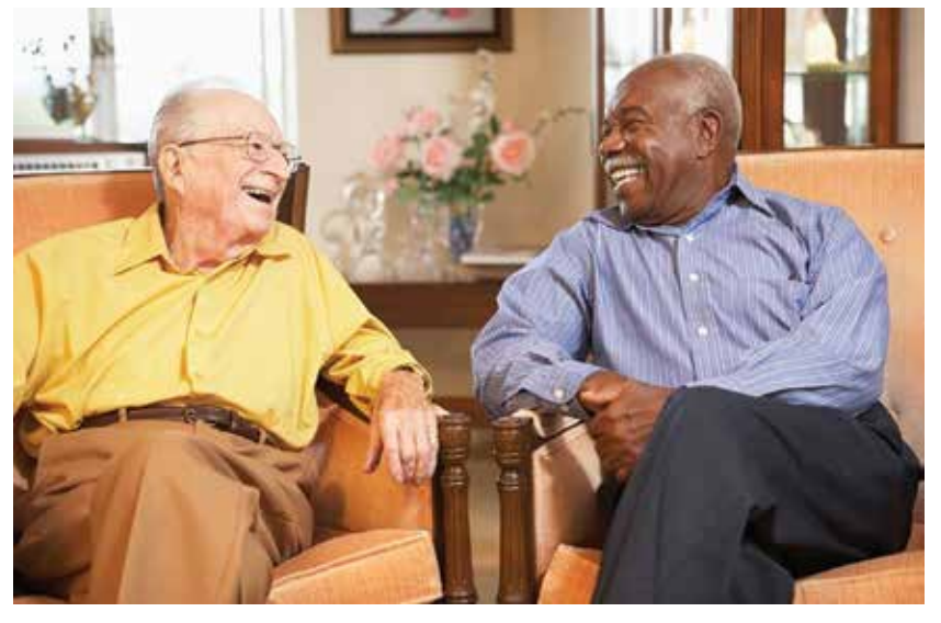
Neighbor to Neighbor received the South Carolina Association of Nonprofit Organizations' Award for Nonprofit Excellence in 2016"

One of the best ways to fight senior isolation is through transportation. Since 2007, Neighbor to Neighbor (N2N) has provided more than 30,000 free transports to senior citizens and those in need. A program of Grace Ministries, a "based in faith" nonprofit serving Horry and Georgetown Counties, N2N provides homebound